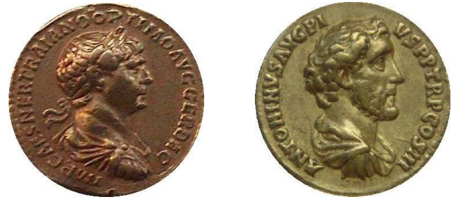
Figure 2: Left: Trajan aureus, Vienna Kunsthistorisches Museum. Right: Antoninus Pius aureus (minted during Ptolemy's lifetime), DIO Collection.

N6 Ptolemy admits ( GD 1.24.1) that his 2-1 rectangle isn't quite exact (§N2): the rectangle's width is only nearly [εγγύστα] two-fold 55 its height. But: why only approximately twice as wide? Why not adjust Y such as to make the ratio exact? — since the priority here is suspected (§N10) to be The Split: a symmetric 2-1 rectangularly-bounded fan, for reasons either aesthetic (symmetry) or practical. (A portable map that is conveniently square after one protective fold?)