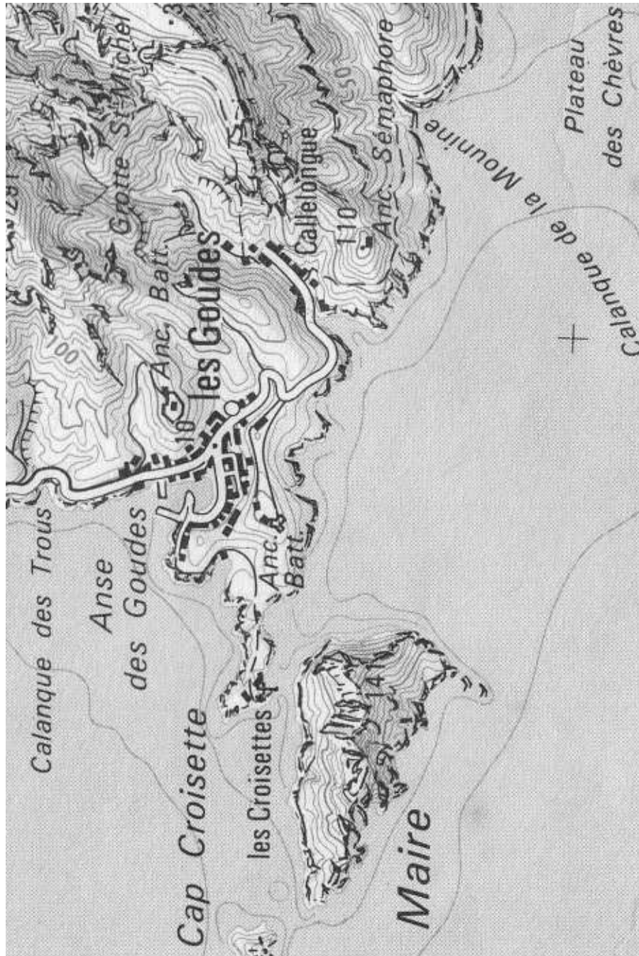
Figure 2: Detail of the region south of Marseille: Cape Croisette, les Goudes, Callelongue. (Carte de France XXXI 45 [IGN].)

that and tested for A.) By contrast, Diller's solution ( \epsilon = 23^\circ 2/3 and A = 0 ) easily falls within 1 standard deviation (sd) for both variables. (Probability P exceeds 2/3 .) I.e., Diller is again vindicated. Doubly. On the nose. 51 But who will be the 1 st Muffioso — after over 80 y of bigotry, ungenerosity, & even viciousness 52 — to own up to this?