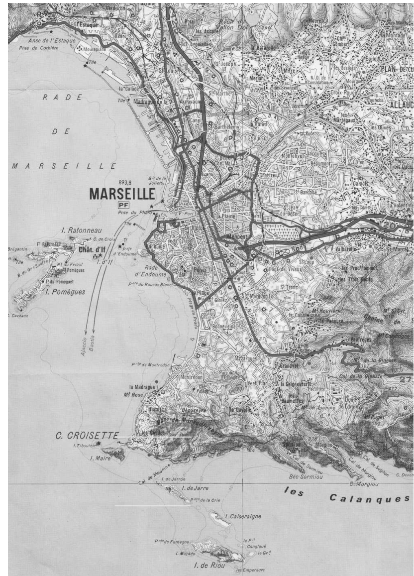
Figure 1: Entire Marseilles harbor (Carte Touristique 67 [Marseilles-Carpentras] Institut Géographique National (IGN) France, Paris), including Cape Croisette area (etc) south of the city. Short, narrow east-west white lines mark eq.5's brackets for the latitude of Pytheas' observatory. (Northern bracket's west end is at latter "E" in "CROISSETTE"; southern bracket's east end is near southeast tip of Isle de Jarre.) The mainland capes immediately west (off map to left) of Marseilles Bay do not stretch as far south as the upper bracket and so are not potential Pytheas-observatory locations.

56 Curious practice: try refuting a discovery (Diller 1934) that's been updated with a remarkably better confirmatory 1994 hit-score (DIO 4.2 p.56 Table 1, or Table 1 here) without citing the update. Likewise, JHA Assoc.Ed Evans 1998 cited Rawlins 1982C, but not the revealing later DIO update's new clincher-evidence at Rawlins 1994L §C. (Our comments: ‡1 fnn 2&7, & www.dioi.org/vols/w80.pdf,