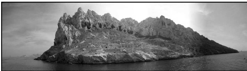
Figure 3: Panoramic view of Maire Island from very nearby W tip of Cape Croisette.

been the most easily accessible for his Marseilles students or clients. (Cape Croisette would also be an apt location for a sailor-explorer: right on the Mediterranean.)