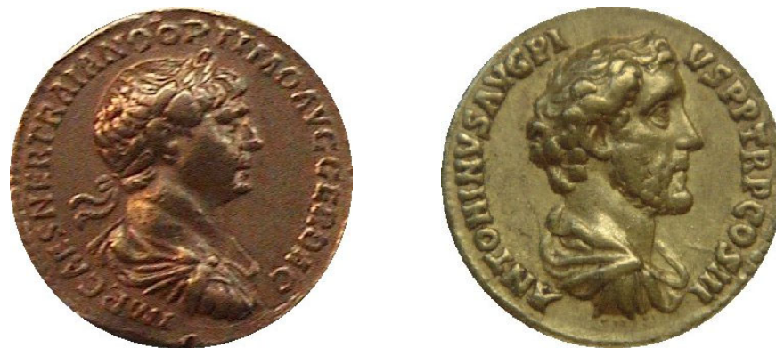
Figure 2: Left: Trajan aureus, Vienna Kunsthistorisches Museum. Right: Antoninus Pius aureus (minted during Ptolemy's lifetime), DIO Collection.

N6 Ptolemy admits ( GD 1.24.1) that his 2-1 rectangle isn't quite exact (§N2): the rectangle's width is only nearly [ \epsilon\gamma\lambda\sigma\tau\alpha ] two-fold 55 its height. But: why only approximately twice as wide? Why not adjust Y such as to make the ratio exact? — since the priority here is suspected (§N10) to be The Split: a symmetric 2-1 rectangularly-bounded fan, for reasons either aesthetic (symmetry) or practical. (A portable map that is conveniently square after one protective fold?)