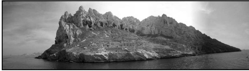
Figure 3: Panoramic view of Maire Island from very nearby W tip of Cape Croisette.

been the most easily accessible for his Marseilles students or clients. (Cape Croisette would also be an apt location for a sailor-explorer: right on the Mediterranean.)